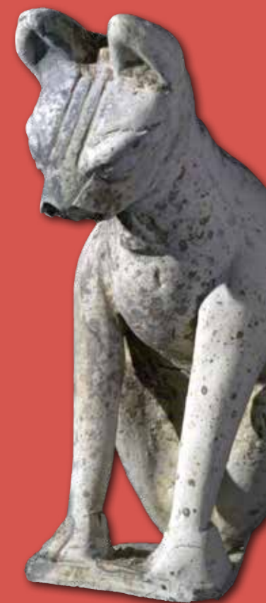
Sitting dog of pipeclay, child's toy (Gaul, 2nd c. AD)